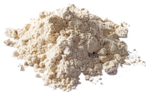
SAVORINGS NATURAL FLAVOR

AVAILABLE AS: 100% Bovine | 100% Porcine | UV Processed*