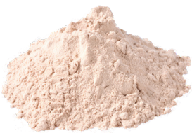
AP 820 & 920 SPRAY DRIED PLASMA

Amplify formulas with plasma. Plasma is a powerful ingredient used in animal diets to help support immune health and positively impact overall well-being while providing benefits for processing functionality.